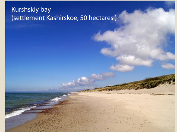
Kurshskiy bay (settlement Kashirskoe, 50 hectares )

The Baltic coast is the one of the most dynamically developing territories of Kaliningrad region. There is an active tourist infrastructure building (aqua-parks, hotels, cafés and restaurants, yacht piers, ect.) as well as housing. GC „Terra-West“ suggests two totally different propositions: the first - the building of tourist and recreation facilities on small lands in dynamically developing settlement Yantarniy and its environs. There's the gambling zone “Yantarnaya” nearby. The second - the development of a big land (more than 50 hectares) on shore of Kurshskiy bay, which is free of building.