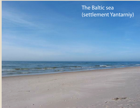
The Baltic sea (settlement Yantarniy)

GC „Terra-West“ proposes the building projects of tourist and recreation facilities on six lands (from 1 to 50 hectares), which are for piers and yacht clubs, hotels and aqua-parks, and also for housing in developing settlement Yantarniy (50 km from Kaliningrad) and its environs. The mentioned lands either adjoin the Baltic coast or they are located not more than 1 km from it.